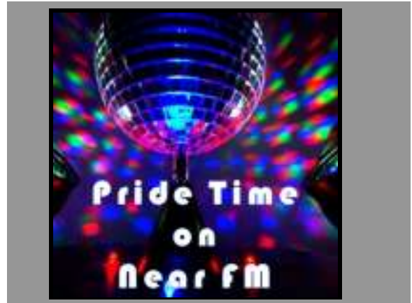
Near's LGBT show Pride Time has launched a brand new website!