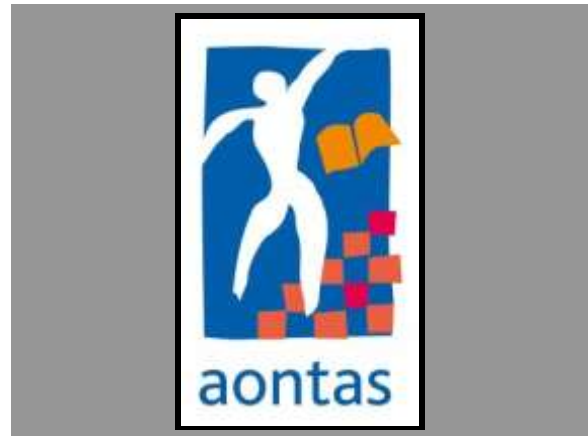
Aontas held a conference which focused on the key role of community education in responding to the current challenges.

The conference entitled Making a Living; Making a Life will also provide practical workshops for community education practitioners as well as a forum for adult learners.