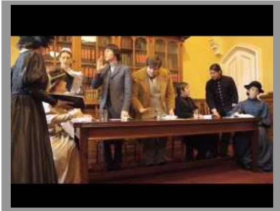
A still from the new CDVEC open day video now available on Vimeo.