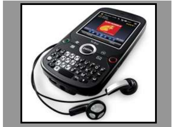
You can listen to Near Fm on your Smartphone!

Or you can download apps such as Tuneinradio or Wunderradio