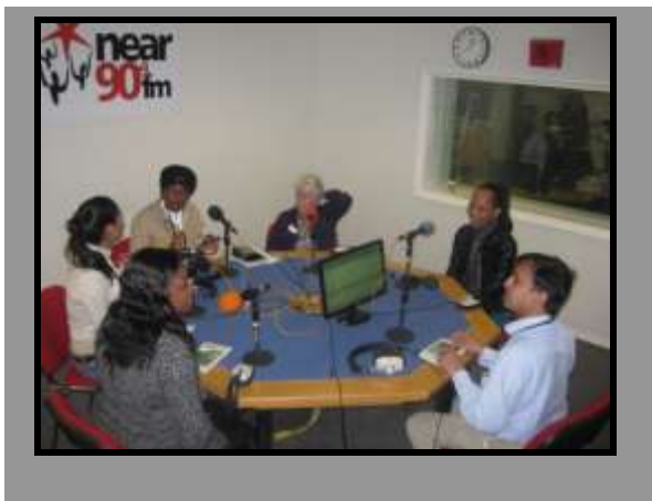
In early December, the second combined FETAC Level 4 in Community Radio and Intercultural Media Literacy course was completed.