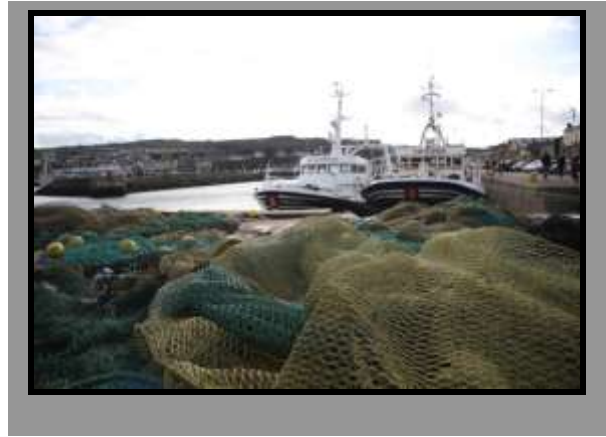
Howth Harbour takes centre stage in the series Howth: Heritage, Community and Maritime Tradition