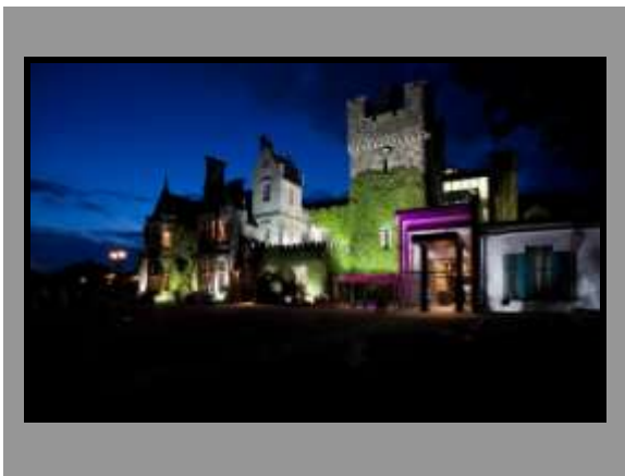
Clontarf Castle will be the venue for this year's Christmas Party on the 17th