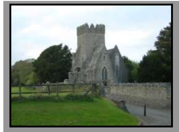
St Doulagh's Church where we will be recording the annual Service of Carols and Readings.

We will be recording the annual Service of Carols and Readings by Candlelight on Sunday 11 th December in St Doulagh's Church to be played on Christmas Day.