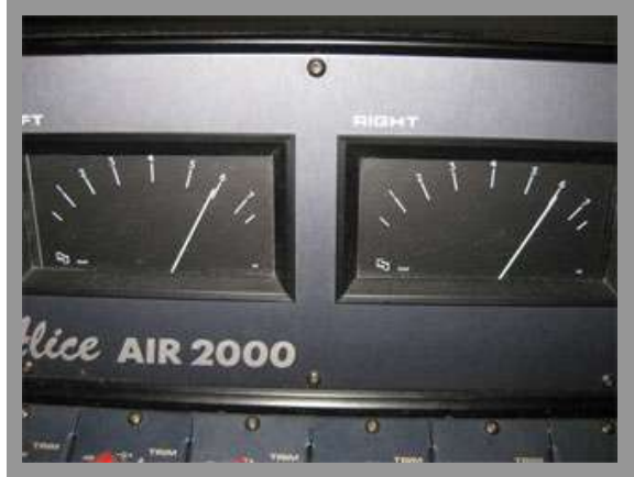
The ideal meter level on the studio mixer is 6.