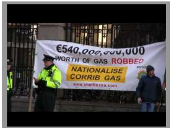
Watch Today outside on the Dail, a video available on Nearmobile, a new YouTube channel

And don't forget to follow us on twitter @nearTV for regular updates.